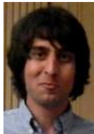
John Odland Graduate Research Fellowship