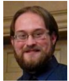
Lester Spicer Poster Award